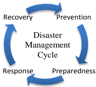
Fig. 2. Phases of disaster management cycle

Disaster management is defined as ‘the integration of all activities required to build, sustain and improve the capabilities to prepare for, respond to, recover from, or mitigate against a disaster’[12]. These four activities focus on risk management (prevention, preparedness) and crisis management (response and recovery) comprise the disaster management cycle as mentioned in Figure 2 [13]. These activities are not independent and sequential; indeed response and recovery phases initiate instantaneously, whereas populations have different long-term or short-term recovery operations can go on for days to months. Moreover, public health and economic recovery processes can take years or beyond that. The ultimate success of response and recovery activities are influenced by the data collected during the preparedness and prevention phases.